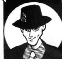
THE HOOD NASTINESS

BUGTOWN is full of amazing oddities. The inhabitants' ability to travel between reality levels is one. Another is the career of THE BULLDAGGERS, Bugtown's premiere insect-rock group. No place is safe from their sonic pursuits.