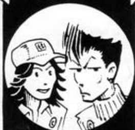
CAROLINES SOME CLONES