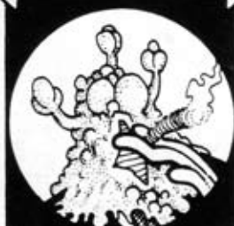
THE LORD C'THULU ELDER GOD