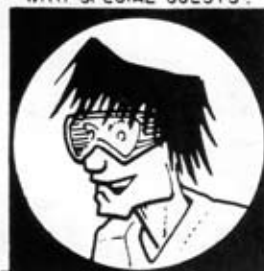
NOSE DATA ELECTRONICS