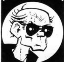
MONSIEUR BOCHE SAMOAN SYNTHETIST