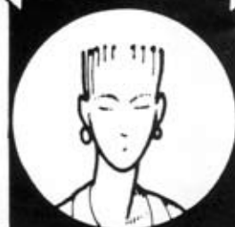
PLEX SYNTHETIC PERCUSSIONS