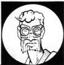
SAVAGE HENRY GUITARIST